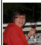
Nic's aim? No less than a well!