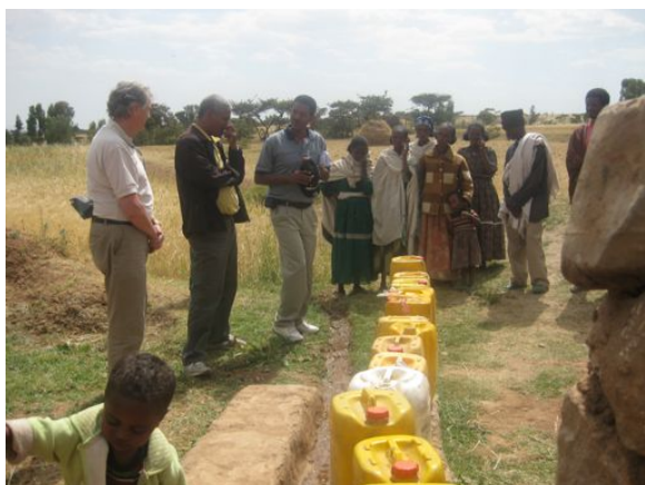
Gerry cans lined up at a new well.