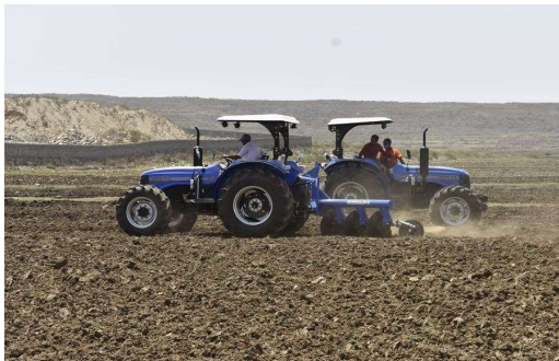
Mechanical oxen! Urgently needed ploughing

The race is on to get resources and plant before the imminent rains. Most families have lost ploughing stock, farming equipment and seeds due to looting by Eritrean and Ethiopian army troops. Our partner REST is providing seed stock and some basic tools. USAID has provided 20 tractors to plough in 6 districts over the next 4 months - more than 14,280 families will benefit. As the conflict in the region is continued, lives of 5 million are under threat of starvation if they are not able to plough their farmland in the main summer. This support will save thousands of lives. REST says thanks to donors for life saving support. Our partner, the Relief Society of Tigray (REST) is working on distribution of emergency food to 3.37 million people.