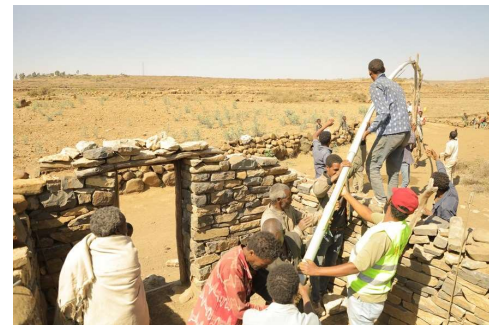
Community repairing its damaged well