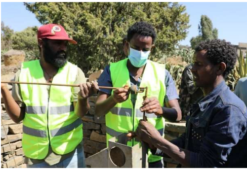
Relief Society of Tigray technicians replacing a damaged pump valve