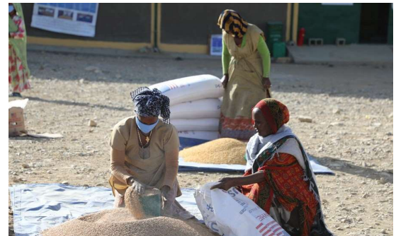
REST food grain distribution. 50,000 MT needed now

WellWishers has agreed to be part of REST's response to the terrible crisis. REST are working to supply emergency food aid for 3.37 million people, restoring 2,182 damaged wells, providing 3,317 tonnes of seed for planting in 34,541 hectare of land, poultry and animal support, restocking, and cash support in 4 districts.