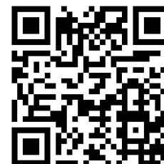
QR code for GiveNow

Please tick if you are happy for us to use your donation for (non-water) emergency support in Tigray (next 12 months only).